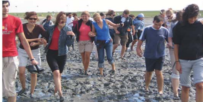
New experiences: Learning how to skate or exploring the mud flats

For the tenth time the Leo-Clubs of Northern Germany organize the "International Leo Youth Camp for Blind People" in summer 2008. Approximately 20 blind as well as partially sighted young adults at the age of 16 to 25 from all over Europe are welcome to join the camp. The camp will be from August 2 till August 16, 2008 in Klingberg near Scharbeutz (at the Baltic Sea) in Schleswig-Holstein. The participants and 12 young people as attendants will live in a youth hostel suited for handicapped people. The language spoken in the camp will be English, for the participants as well as for the attendants.